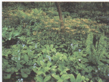
naturalized woodland perennials

Some simple, very natural-looking plantings (naturalized deer-resistant perennials, masses of ferns) at the entrance to, and in pockets along, the new woodland path are suggested for understory interest and rhythm.