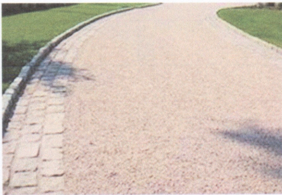
oil & stone, belgian block

The current driveway layout is straightforward, but uninspired; the proposed driveway layout encourages a slower, more thoughtful approach to the house and allows us to screen the driveway from both front door and road. A turn-around space and extra parking will be retained, but reconfigured as shown. Surface of the new driveway can be asphalt or, if budget permits, oil & stone with cobblestone elements (see images).