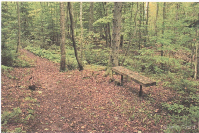
bench along woodland path

A simple, rustic bench or hammock along the new woodland path— somewhat visible from the porch— would provide a nice resting spot and visual interest.