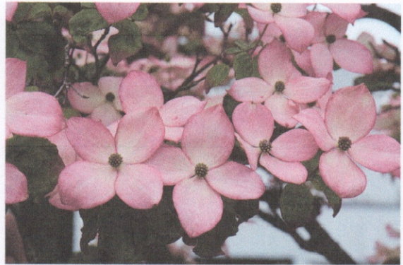
Japanese maple, paperbark maple, native dogwood - pink

These trees will frame the exposed side of the new patio and create a courtyard effect, which should make spending time there pleasant and peaceful. Although the original drawings showed sufficient space for planting along both sides of stairs, the actual construction does not allow for that.