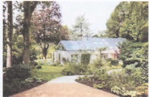
curved driveway flanked by plantings, slower approach to entrance