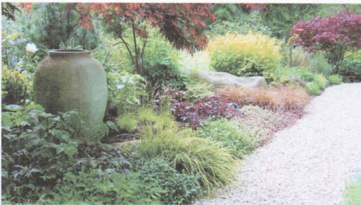
inspirational planting: a mix of shrubs and ground covers for texture and color

A swath of natural-looking, cohesive plantings are proposed to hug the driveway, road frontage and front patio to soften the hardscapes, anchor the human-made elements into the landscape, offer visual interest to complement the residence, and screen unwanted views. Recommended plant palette includes conifers, boxwood, ornamental grasses, bayberry, azaleas, blueberries, mountain laurel, and herbaceous perennials — plants chosen for a relatively low-maintenance, native, unfussy garden. A few specimen trees are noted on the plan - evergreens (japanese cedar) and a deciduous tree (a pin oak, ginkgo, or cornelian cherry). The new plantings are conceived to create a natural and tranquil transition between the human made elements of the landscape and the “wild” surrounding woods. Some native rocks, which relate to the stone ledge found in the area, can be placed in the planting beds for interest and mass.